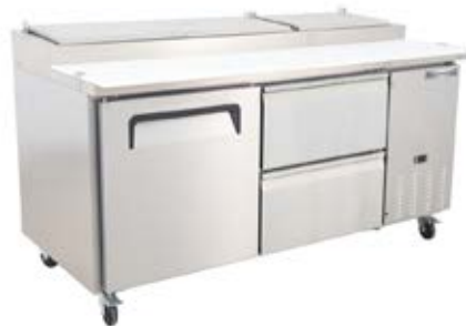
Pizza Prep Table 70" 2 Drawers