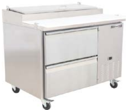
Pizza Prep Table 47" 2 Drawers