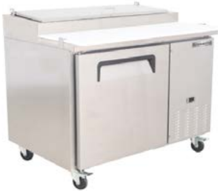
Pizza Prep Table 47"