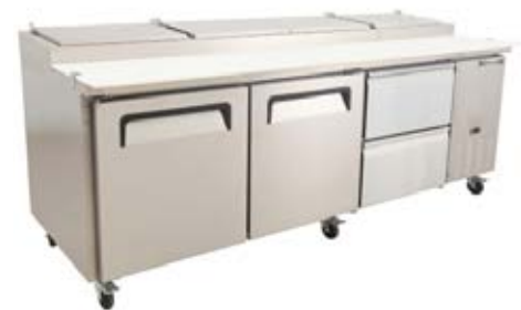
Pizza Prep Table 94" 2 Drawers