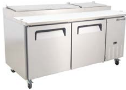
Pizza Prep Table 70"