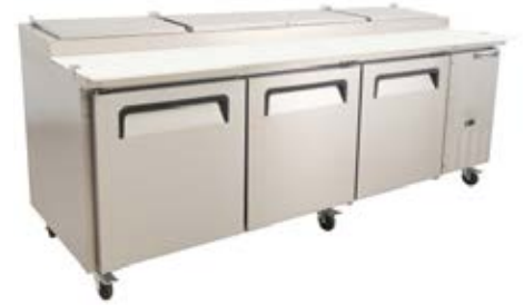
Pizza Prep Table 94"