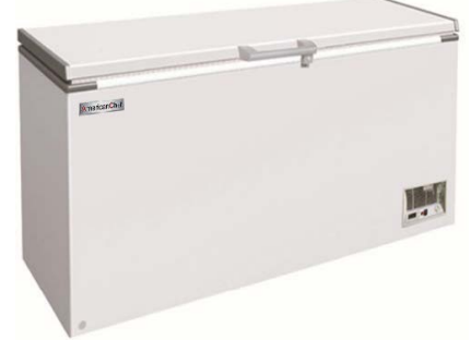
Solid Door Chest Freezer 55"