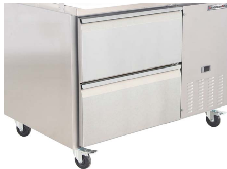
Pizza Prep Table 70" 2 Drawers