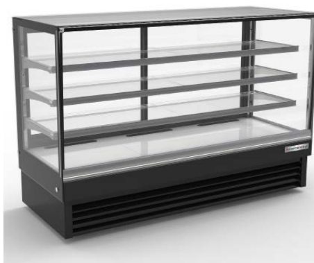
Squared Display Case 48"