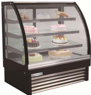
Curved Display Case 72"