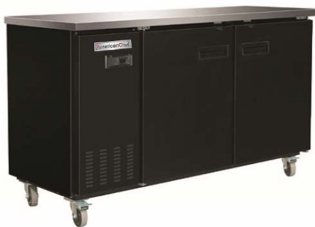
Back Bar Cooler 69"