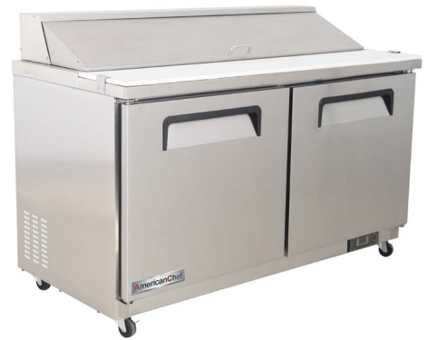
Sandwich Prep 60"