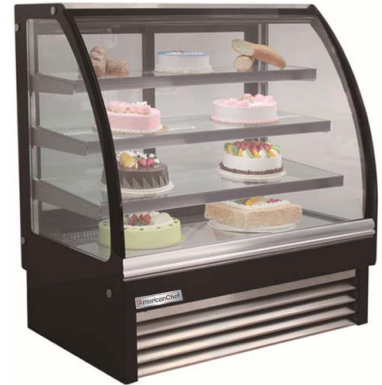
Curved Display Case 60"