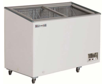
Flat Door Chest Freezer 47"