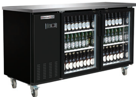
Back Bar Cooler 69"