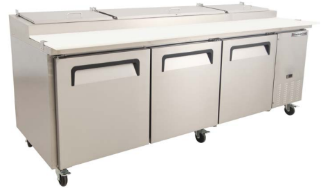
Pizza Prep Table 94"