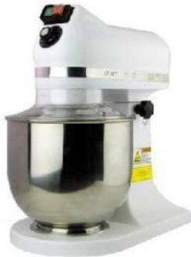
Food Mixer 7 qt