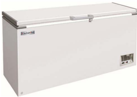
Solid Door Chest Freezer 71"