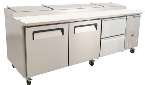
Pizza Prep Table 94" 2 Drawers