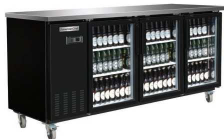
Back Bar Cooler 90"