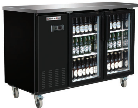
Back Bar Cooler 59"