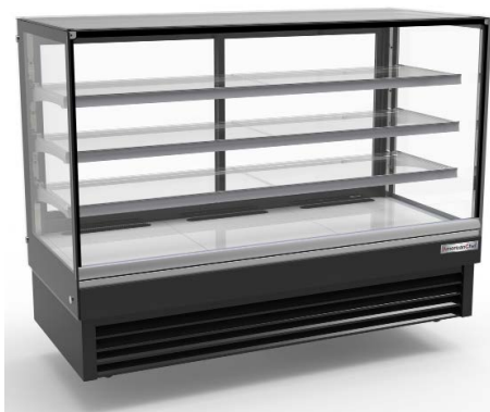
Squared Display Case 36"