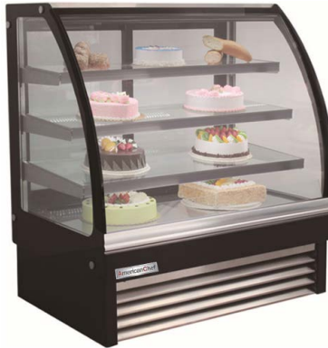
Curved Display Case 48"