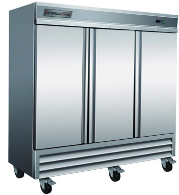
Reach-in Cooler 81"