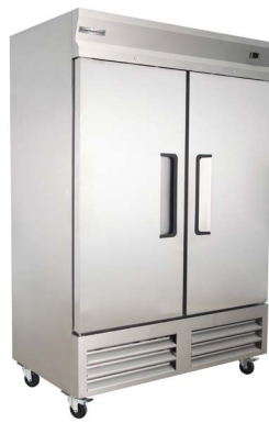
Reach-in Cooler 54"