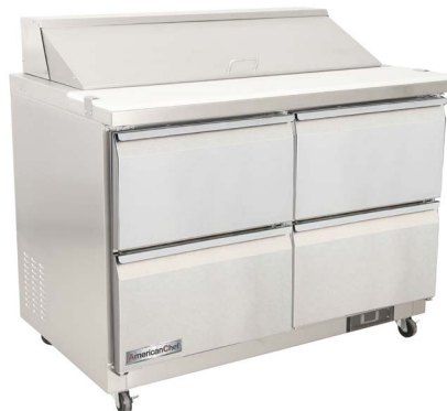
Sandwich Prep 60" 4 Drawer