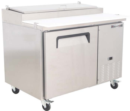
Pizza Prep Table 47"