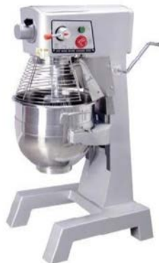
Planetary Mixer 40 qt