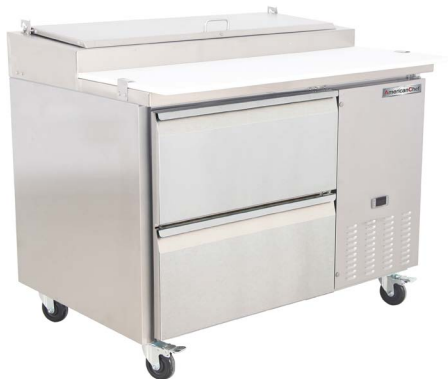
Pizza Prep Table 47" 2 Drawers