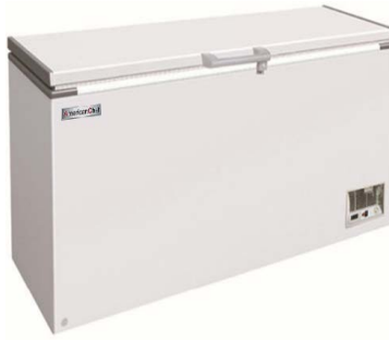
Solid Door Chest Freezer 47"