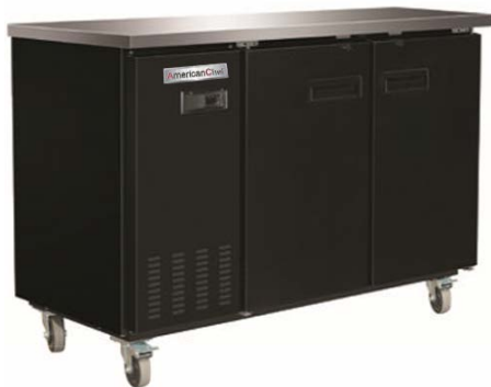
Back Bar Cooler 59"