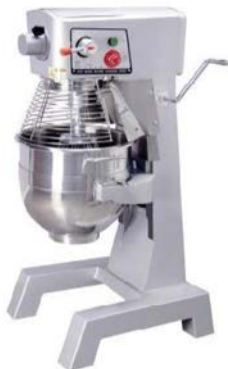
Planetary Mixer 30 qt