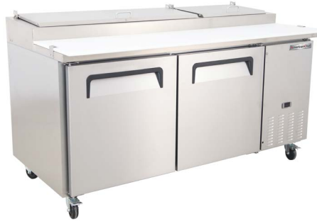
Pizza Prep Table 70"