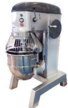
Planetary Mixer 60 qt