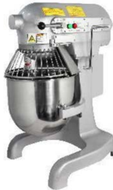
Planetary Mixer 10 qt