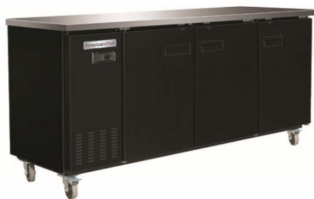
Back Bar Cooler 90"