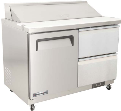
Sandwich Prep 48" 2 Drawer