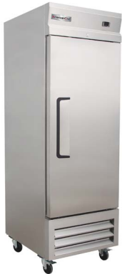
Reach-in Cooler 27"