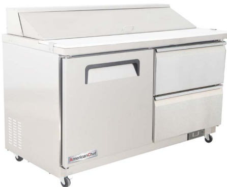
Sandwich Prep 60" 2 Drawer