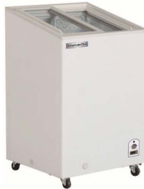
Flat Door Chest Freezer 38"