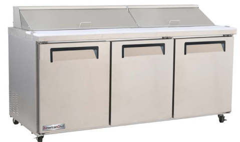
Sandwich Prep 72"