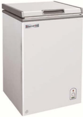
Solid Door Chest Freezer 38"