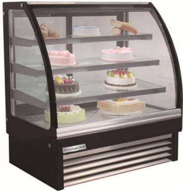
Curved Display Case 36"