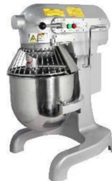
Planetary Mixer 20 qt