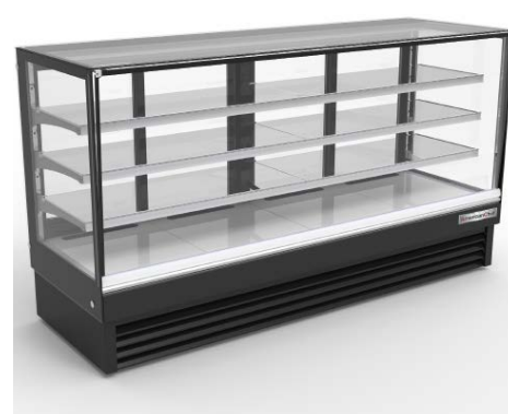
Squared Display Case 60"